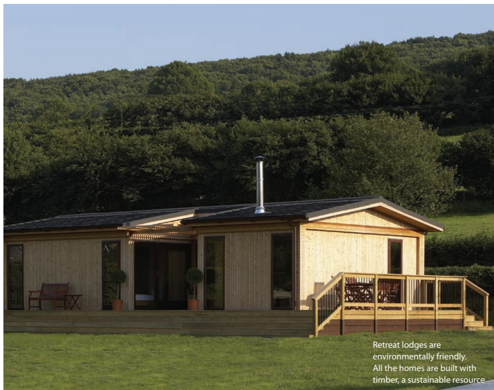
Retreat lodges are environmentally friendly. All the homes are built with timber, a sustainable resource

Retreat Homes was the brainchild of London-based architects Buckley Gray Yeoman; it was created after they were challenged to design a new concept of holiday home lodge living. The result was nothing like the preconceived idea of a holiday home. Its modern and cutting-edge design caused quite a stir within the holiday home industry. Many critics dismissed this radical reinvention of the mobile home, thinking it was 'too modern' for the industry. How wrong they were; The Retreat simply pushed the boundaries, capturing the public's eye for high quality, innovative, architectural design.