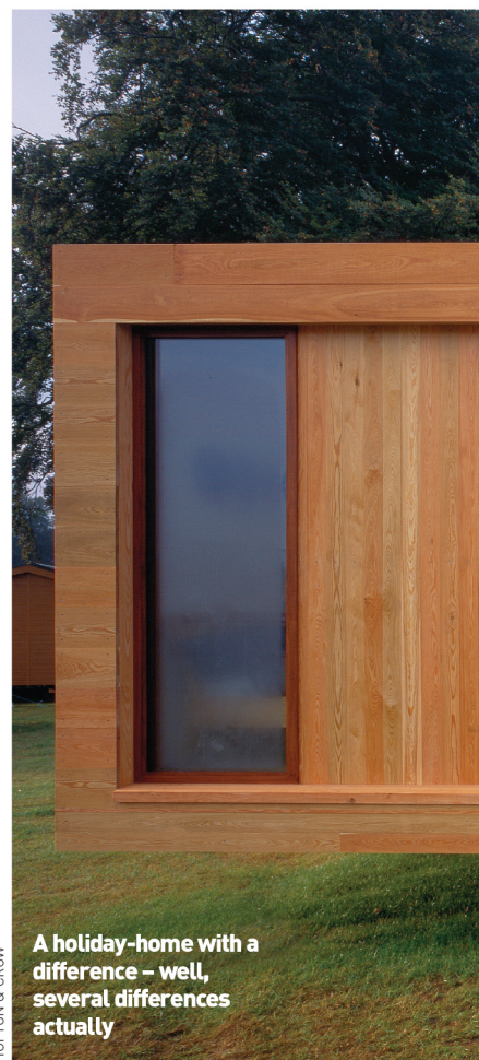
A holiday-home with a difference - well, several differences actually

The architects behind the Retreat like to think that people will personalise their own space with furniture and accessories they choose. I am sure that some will indeed do that. Equally, others will like the whole thing as it is, designed with furniture