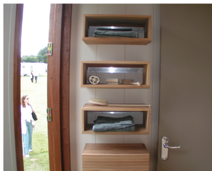
ABOVE Imaginative wood shelving