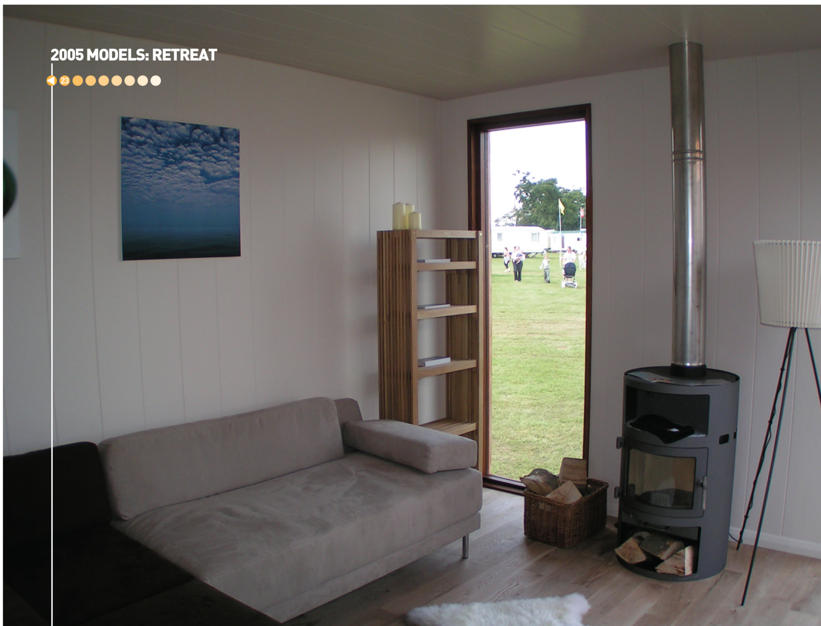
ABOVE The fabulous wood-burning stove