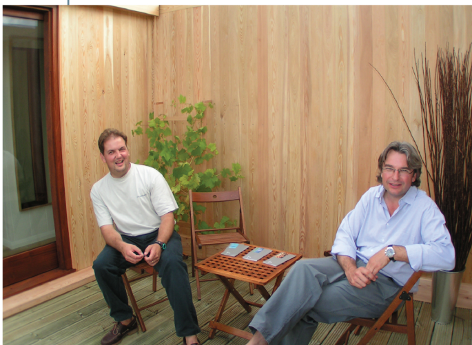
LEFT The decked patio at the front